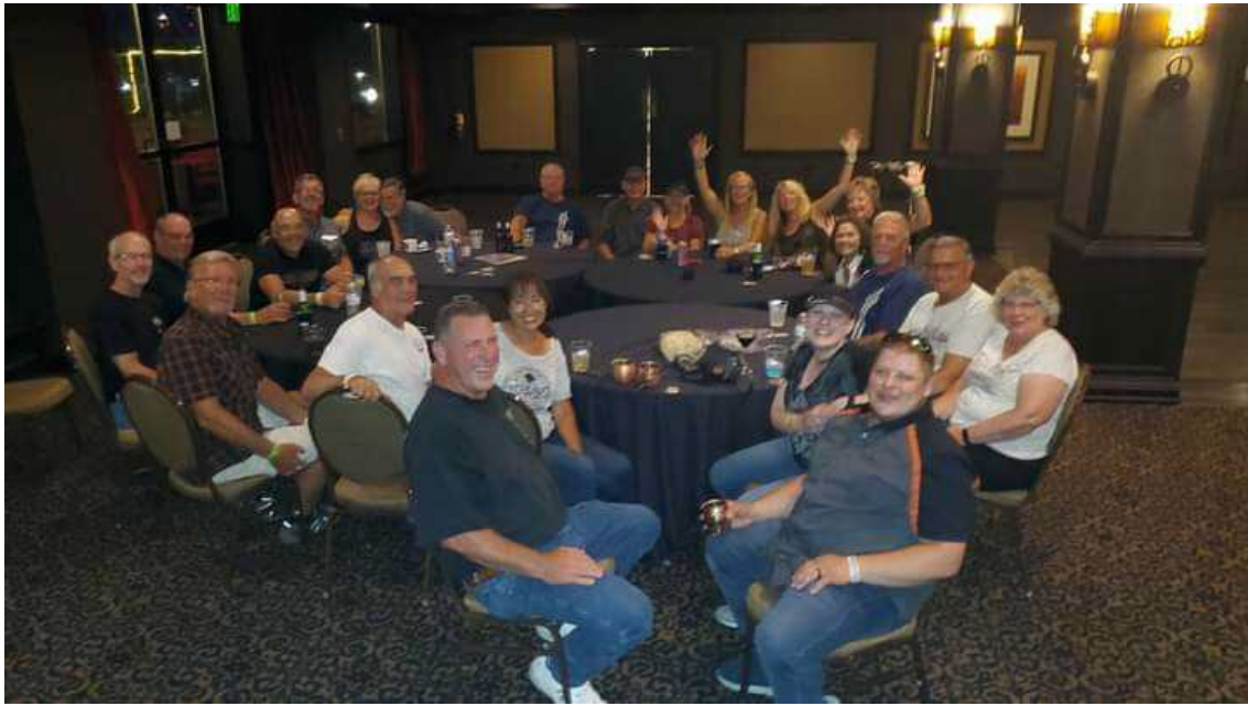
Bull Falls Harley round table discussion