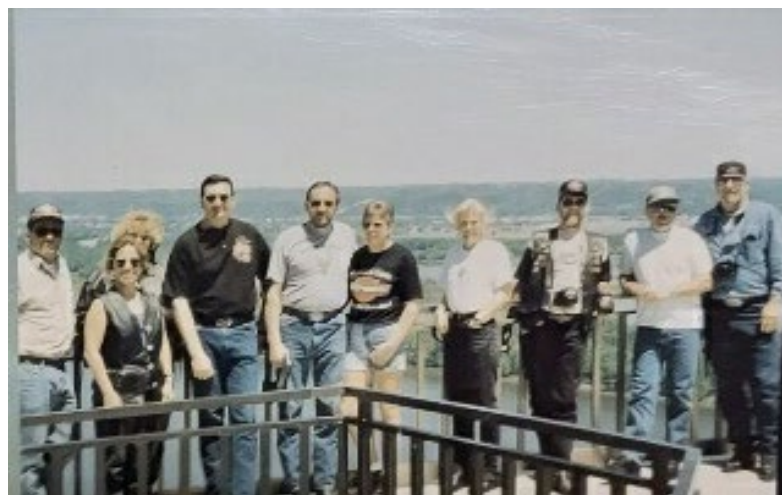
Chapter Photo Pike's Peak about 1996

For those going to Sturgis, have a great time and safe travels! There is a lot of riding and events to attend this summer. The August and September Cruisin' For A Cause Ride, the Home Town Harley-Davidson Rally over Labor Day weekend in Milwaukee, the North Woods Rally in Tomahawk, and others. Make plans to attend the HD 120 th Anniversary – HOG 40 th and HD Museum 15 th Anniversary in Milwaukee July 13-16, 2023.