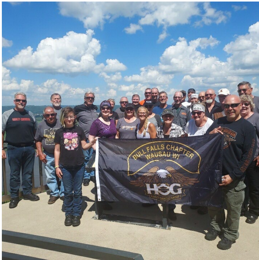
Chapter at Pike's Peak July 20, 2022